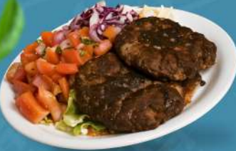
CHAPLEE KEBAB (MUTTON) تشابلي كباب (لحم ضأن) 49,00 AED