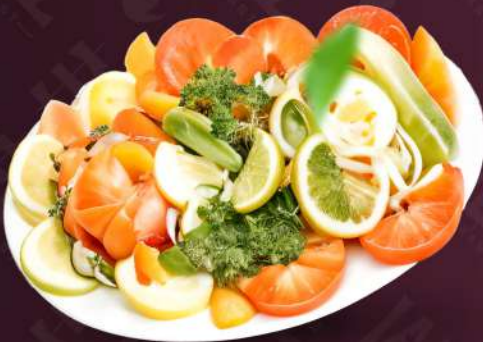
MIX SALAD سلطة مشكله 23,00 AED