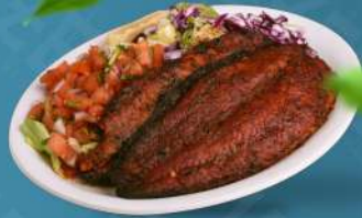
FISH TANDOORI سمك تندوري 39,00 AED