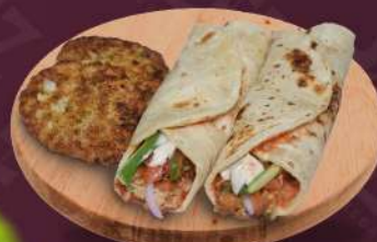
CHICKEN CHAPLEE WRAP راب شابلي دجاج