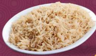
PLAIN STEAMED RICE رز