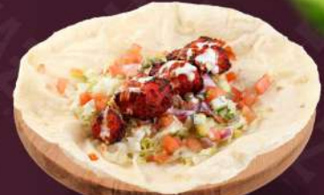
TANDOORI WRAP راب تندوري