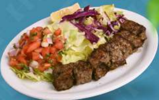
MUTTON TIKKA KEBAB كباب لحم تيكا (لحم ضأن) 49,00 AED