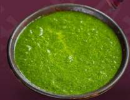
MINT-CHUTNEY شتني نعناع