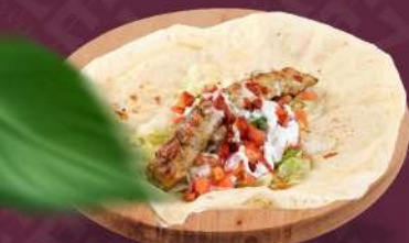
MUTTON CHAPLEE WRAP راب شابلي لحم ضأن