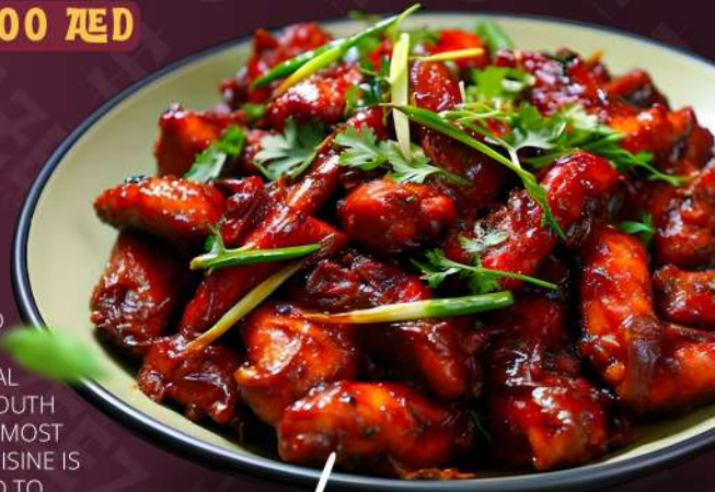
CHILLI CHICKEN DRY/GRAVY دجاج بالفلفل جاف/بالصلصة

CHINESE HAKKA CUISINE IS A DELIGHTFUL FUSION OF BOLD SPICES, SMOKY FLAVORS, AND RICH TEXTURES, INFLUENCED BY TRADITIONAL CHINESE COOKING WITH A SOUTH ASIAN TWIST. ONE OF THE MOST POPULAR DISHES IN THIS CUISINE IS HAKKA NOODLES, STIR-FRIED TO PERFECTION WITH A MEDLEY OF FRESH VEGETABLES, TENDER CHICKEN, OR SUCCULENT PRAWNS. THESE NOODLES ARE TOSSED IN AROMATIC SAUCES, INFUSED WITH GARLIC, SOY, AND A HINT OF SPICE, MAKING THEM AN IRRESISTIBLE CHOICE FOR NOODLE LOVERS.