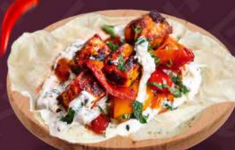
TANDOORI PANEER WRAP راب تندوري بانير