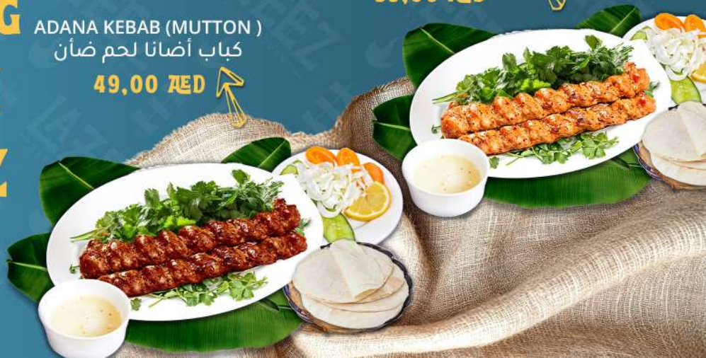
ADANA KEBAB (CHICKEN) كباب أذانا الدجاج 39,00 AED