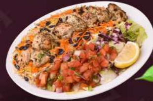
AFGHANI CHICKEN BOTI كباب صدر الدجاج