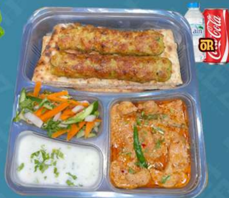
CHICKEN HANDI AND CHICKEN KEBAB دجاج هاندي ودجاج كباب مع نان