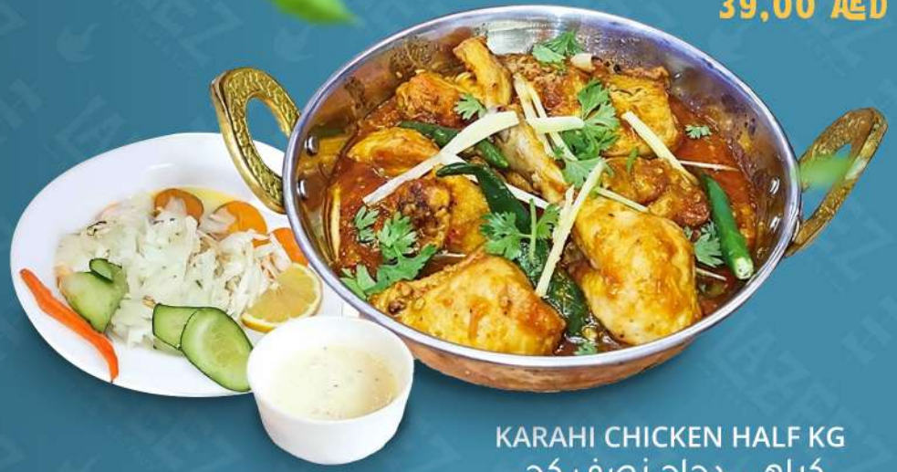
KARAHI CHICKEN HALF KG کراہی دجاج نصف کج