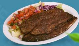
FISH (FRIED) عشاء السمك (مقلي) 39,00 AED