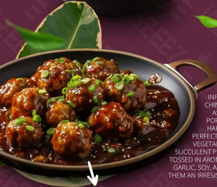
VEG MANCHURIAN DRY/GRAVY مانتشوريان نباتي جاف/بالصلصة