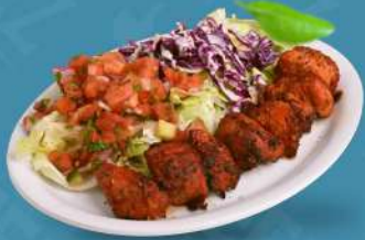
CHICKEN TANDOORI KEBAB تندوري كباب 39,00 AED