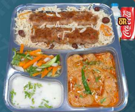
MUTTON HANDI AND MUTTON KEBAB دجاج هاندي ودجاج كباب

OUR HANDI DISHES ARE SLOW-COOKED IN A RICH, VELVETY GRAVY MADE FROM TOMATOES, ONIONS, YOGURT (LABAN), AND TRADITIONAL SPICES. THIS SLOW SIMMERING PROCESS ENHANCES THE DEPTH OF FLAVORS, MAKING EVERY BITE TENDER AND AROMATIC. WHETHER IT'S CHICKEN, LAMB, OR PANEER, EACH HANDI IS A HEARTY AND FLAVORFUL DISH, BEST ENJOYED WITH FRESH NAAN OR FRAGRANT RICE. A TRUE COMFORT FOOD EXPERIENCE!