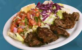
CHOPAN KEBAB (LAMB CHOPS) كباب تشوبان (ريش لحم الضأن) 55,00 AED

OUR FRESH AFGHANI SALADS BRING A CRISP, REFRESHING BALANCE TO THE RICH FLAVORS OF BARG KEBAB, CHAPLI KABOB, CHUPAN KEBAB, WAZERI KABOB, SULTANI KEBAB, AND TANDOORI FISH. PAIR THEM WITH SOFT, HAND-TOSSED NAAN, PERFECT FOR SCOOPING UP JUICY BITES OF FRY HAMOUR, FRY FISH, AND CHICKEN BREAST. A SIMPLE YET ESSENTIAL PART OF THE LAZEEZ EXPERIENCE!