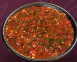
AFGHANI CHUTNEY شتني افغاني