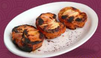
GRILLED TOMATO SKEWER سيخ طماطم مشوي