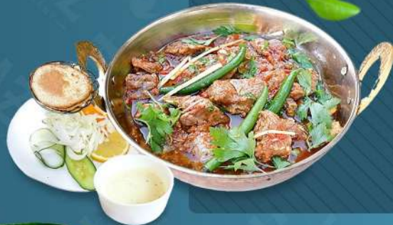
PESHAWARI KARAHI MUTTON FULL KG بشاوري کراہی لحم ضأن - (1 کج)

KARAHI IS A RICH AND FLAVORFUL DISH COOKED IN A TRADITIONAL WOK-LIKE PAN CALLED A "KARAHI." MADE WITH TENDER MEAT, TOMATOES, GARLIC, GINGER, AND AROMATIC SPICES, IT IS SLOW-COOKED TO PERFECTION, ALLOWING THE FLAVORS TO BLEND BEAUTIFULLY. WHETHER PREPARED WITH CHICKEN, MUTTON, OR EVEN SEAFOOD, KARAHI IS KNOWN FOR ITS BOLD TASTE AND THICK, SPICY GRAVY. OFTEN SERVED WITH NAAN OR RICE, THIS DISH IS A FAVORITE AT GATHERINGS, OFFERING A COMFORTING AND SATISFYING EXPERIENCE WITH