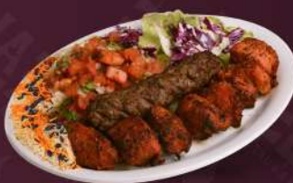
TANDOORI WAZERI تندوري وزيری