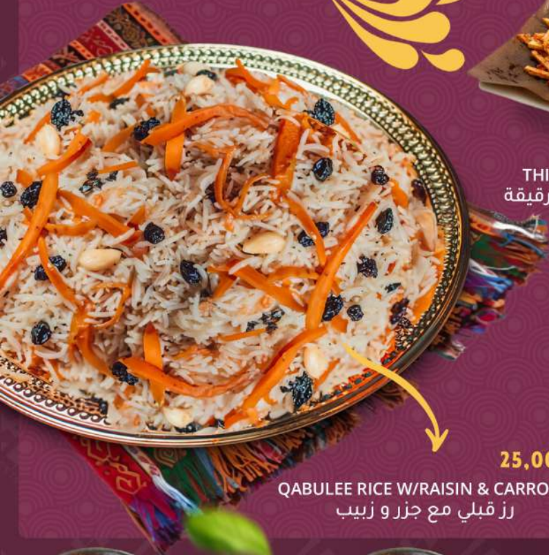
QABULEE RICE W/RAISIN & CARROTS رز قبلي مع جزر و زبيب