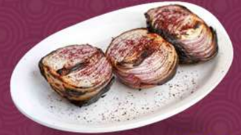
GRILLED ONION SKEWER سيخ بصل مشوي