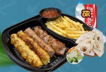
CHICKEN AND MUTTON KEBAB دجاج و لحم كباب