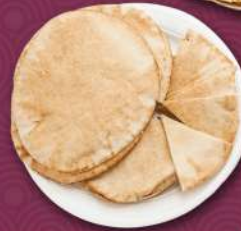
KHUBUZ خبز عربي