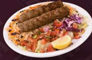
KOFTA KEBAB (MUTTON) كباب كفتة (لحم ضأن)