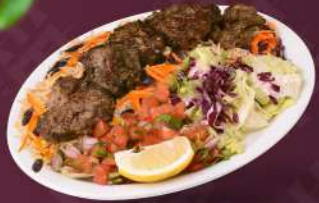
CHOPAN KEBAB (MUTTON CHOPS) ریش ضأن مشوي