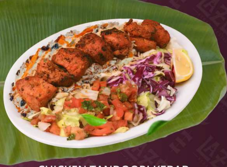
CHICKEN TANDOORI KEBAB كباب تندوري دجاج