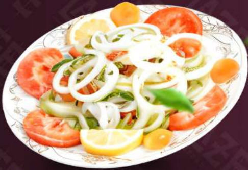
ARABIC SALAD سلطة عربية 20,00 AED