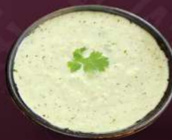
MINT-CHUTNEY WITH YOGURT شتني نعناع بالبن