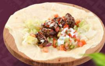
MUTTON TIKKA WRAP راب تيكا لحم ضأن