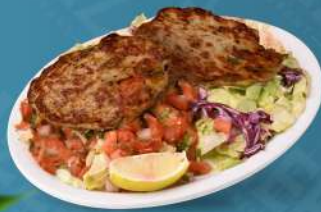
CHICKEN CHAPLEE KEBAB دجاج شابلي كباب 39,00 AED