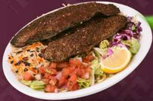
FISH DINNER (FRIED) سمك (مقلي)