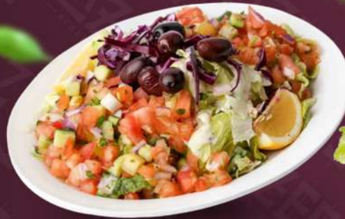
FAMOUS AFGHANI SALAD السلطة الأفغانية المشهورة 18,00 AED