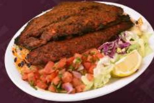
FISH TANDOORI سمك تندوري