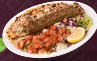
WAZERI KEBAB كباب وزيری