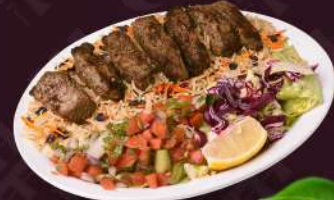
BARG KEBAB كباب برغ