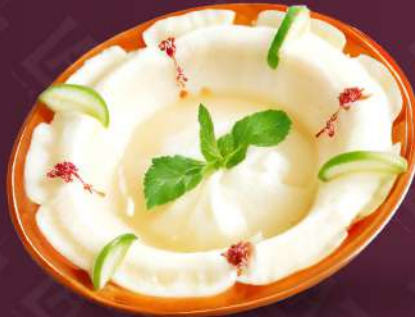
HAMMOUS حمص 18,00 AED