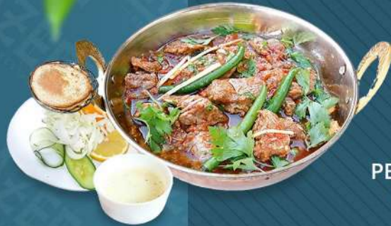
KARAHI MUTTON HALF KG بشاوري کراہی لحم ضأن - (نصف کج)