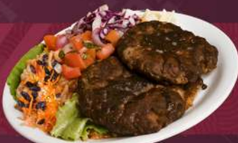
CHAPLEE KEBAB (MUTTON) تشابلي كباب (لحم ضأن)