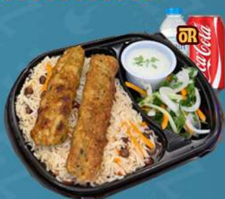
CHICKEN KEBAB دجاج كباب مع بولانو أفغاني