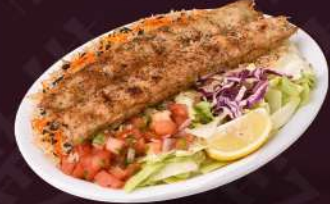
CHICKEN KOFTA KEBAB كباب كفتة الدجاج