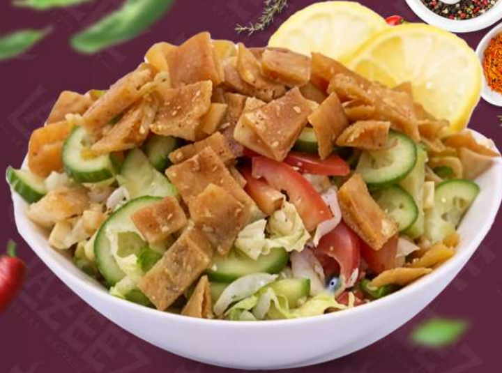
FATOUSH فتوش 25,00 AED

INDULGE IN OUR REFRESHING SELECTION OF SALADS, CRAFTED TO COMPLEMENT EVERY MEAL. FROM THE CRISP ARABIC SALAD, THE RICH AND FLAVORFUL FAMOUS AFGHANI SALAD, TO OUR CHEF'S SIGNATURE SPECIAL SALAD, EACH DISH IS PREPARED WITH THE FRESHEST INGREDIENTS. ENJOY OUR MIX SALAD, A VIBRANT BLEND OF TOMATOES, CUCUMBERS, ONIONS, AND LETTUCE, OR SAVOR THE CREAMY GOODNESS OF HUMMUS AND YOGURT, SERVED WITH A TOUCH OF AUTHENTICITY. PERFECTLY BALANCED AND BURSTING WITH FLAVOR, OUR SALADS OFFER A DELIGHTFUL MIX OF TRADITION AND TASTE.