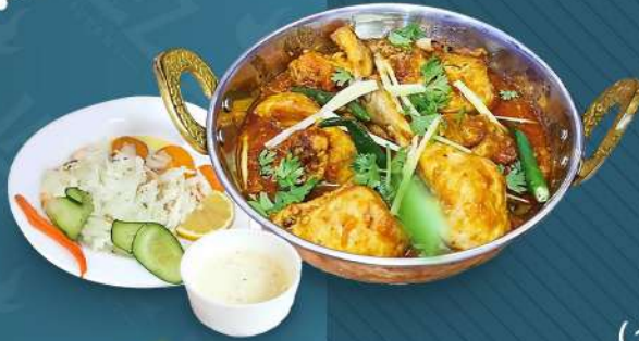
KARAHI CHICKEN FULL 1KG بشاوري کراہی دجاج 1 کج