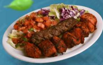
TANDOORI WAZIRI تندوري وزير 49,00 AED