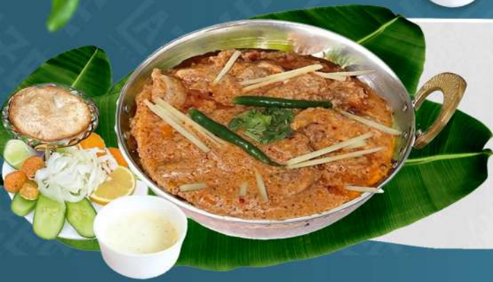
CHICKEN BONELESS HANDI HALF KG 45,00 AED هندي دجاج بدون عظم - (نصف کج)

KARAHI IS A RICH AND FLAVORFUL DISH COOKED IN A TRADITIONAL WOK-LIKE PAN CALLED A "KARAHI." MADE WITH TENDER MEAT, TOMATOES, GARLIC, GINGER, AND AROMATIC SPICES, IT IS SLOW-COOKED TO PERFECTION, ALLOWING THE FLAVORS TO BLEND BEAUTIFULLY. WHETHER PREPARED WITH CHICKEN, MUTTON, OR EVEN SEAFOOD, KARAHI IS KNOWN FOR ITS BOLD TASTE AND THICK, SPICY GRAVY. OFTEN SERVED WITH NAAN OR RICE, THIS DISH IS A FAVORITE AT GATHERINGS, OFFERING A COMFORTING AND SATISFYING EXPERIENCE WITH