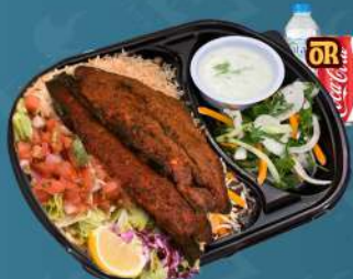
TANDOORI FISH سمك تندوري