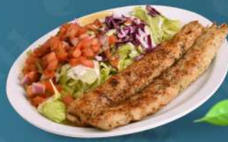
CHICKEN KOFTA KEBAB كباب كفتة الدجاج 39,00 AED