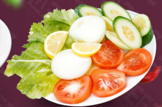
SPECIAL SALAD سلطة خاصة 16,00 AED