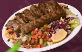
SULTANI KEBAB (MUTTON) كباب سلطاني (لحم ضأن)