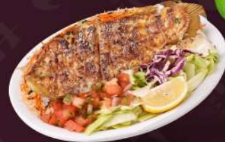
HAMOUR FILLET FRY سمكة هامور مقلية