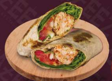
CHICKEN KOFTA WRAP راب كفتة دجاج