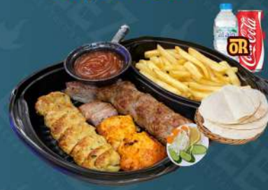
MIX AFGHANI BBQ كباب أفغاني مشكل