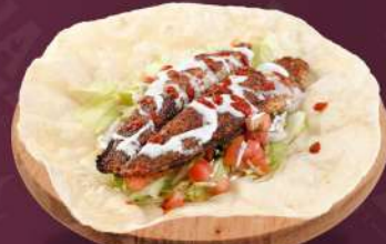
FISH WRAP راب سمك