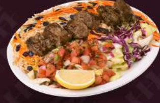
MUTTON TIKKA KEBAB كباب تیکا (لحم ضأن)