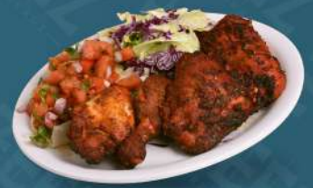
HALF CHICKEN KEBAB نصف دجاجة كباب 39,00 AED