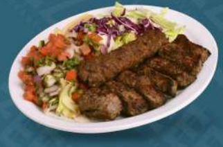
SULTANI KEBAB سلطاني كباب 49,00 AED