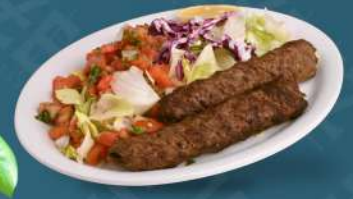
KOFTA KEBAB (GROUND MUTTON) كباب كفتة (لحم ضأن مفروم) 49,00 AED