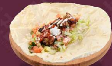
AFGHANI CHICKEN BOTI WRAP راب دجاج افغاني بوتی