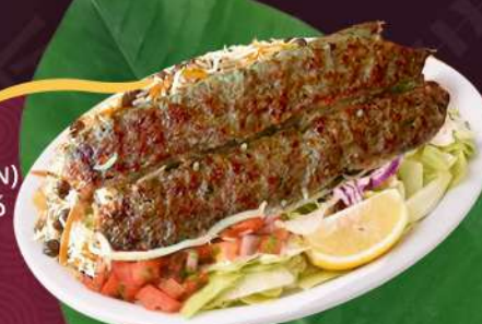
ADANA KEBAB (CHICKEN) كباب شامي دجاج