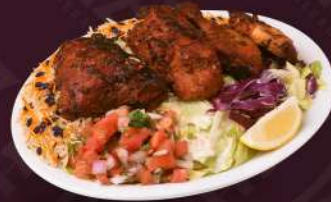
HALF CHICKEN KEBAB نصف دجاجة كباب