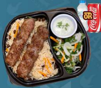
MUTTON KEBAB لحم كباب مع بولانو أفغاني