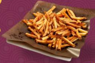
THIN CUT FRENCH FRIES بطاطس مقلية قطع رقيقة