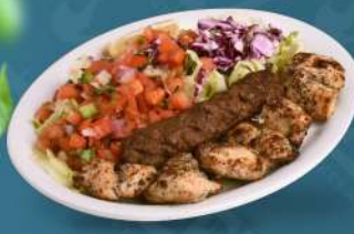
WAZERI KEBAB كباب وزير 49,00 AED