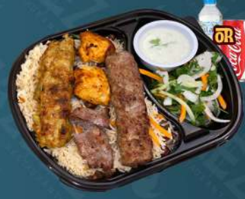
MIX BBQ كباب مشكل مع بولانو أفغاني