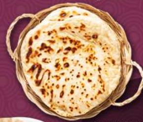
AFGHANI ROTI روتی افغاني