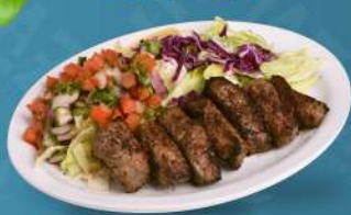
BARG KEBAB برغ كباب 49,00 AED