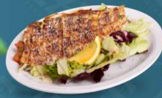
HAMOUR FILLET FRY سمكة هامور مقلية 39,00 AED