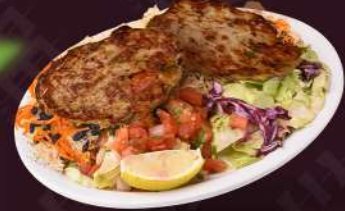
CHICKEN CHAPLEE KEBAB كباب دجاج شابلي