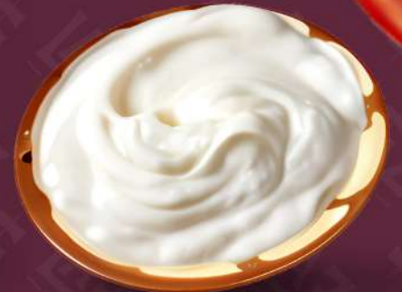
YOGURT لبن زبادي 14,00 AED